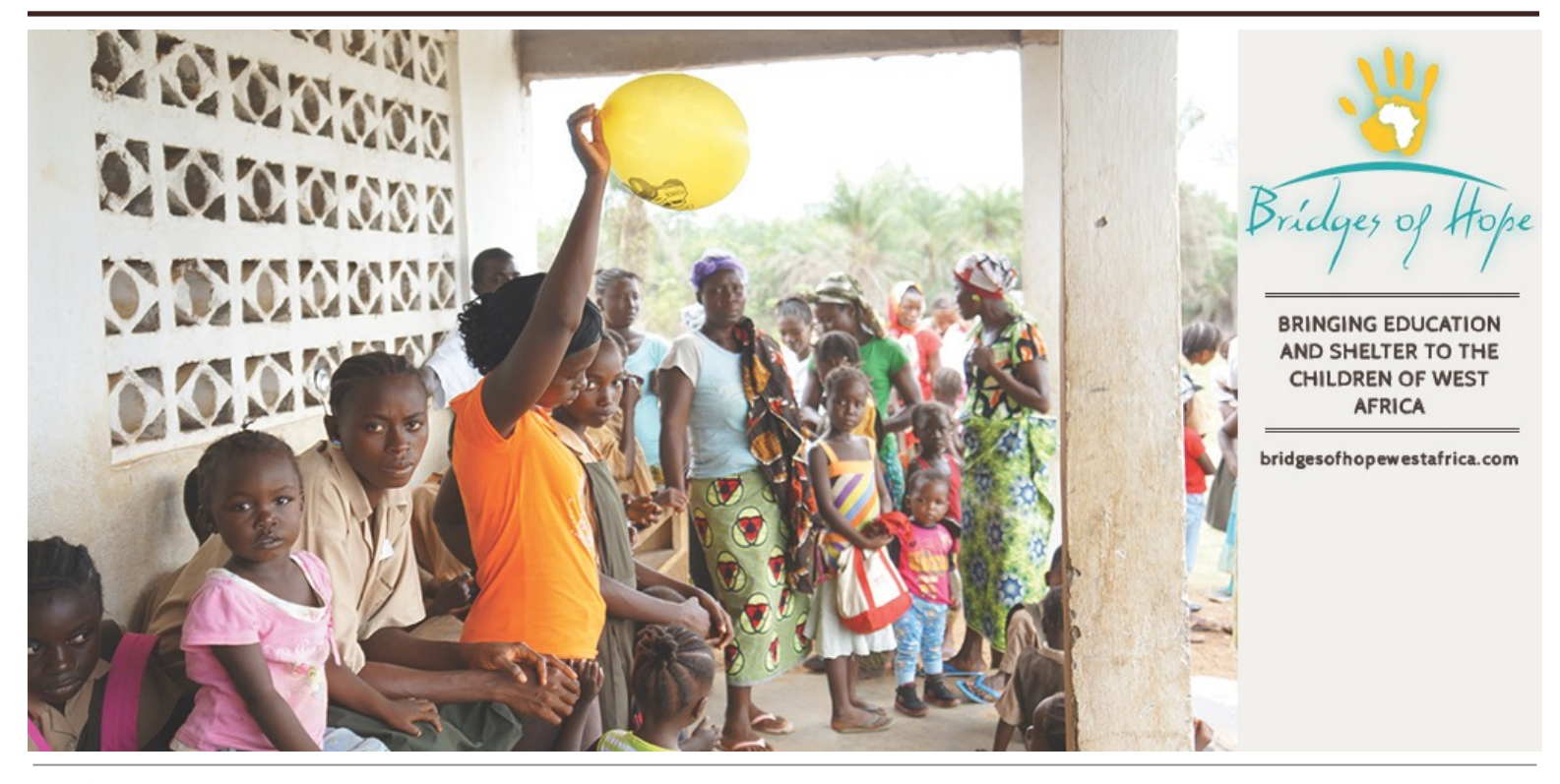
"Religion that God our Father accepts as pure and faultless is this: to look after orphans and widows in their distress and to keep oneself from being polluted by the world."