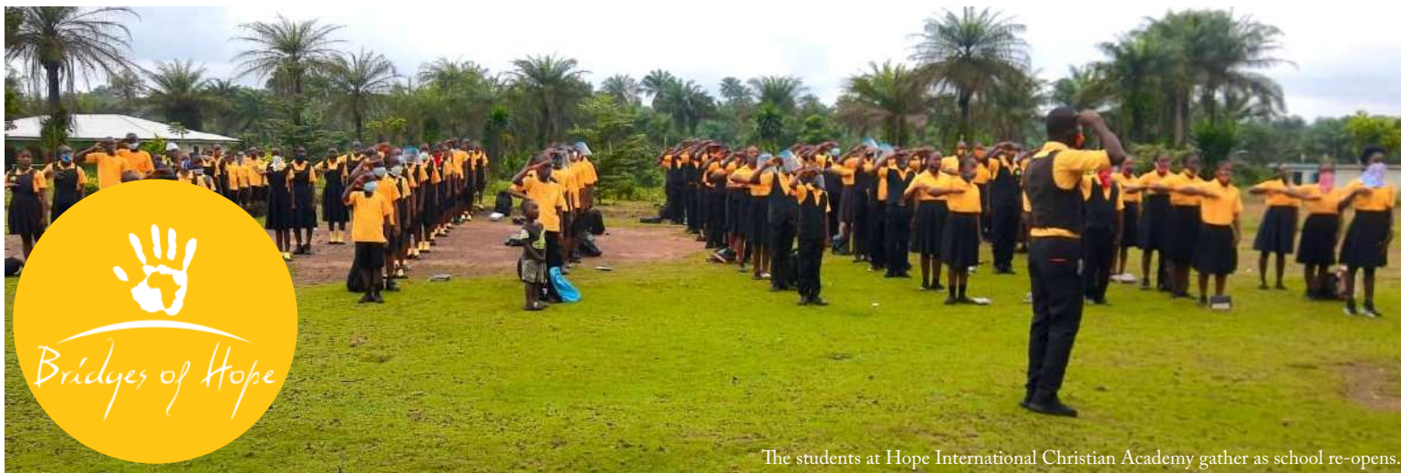
The students at Hope International Christian Academy gather as school re-opens.